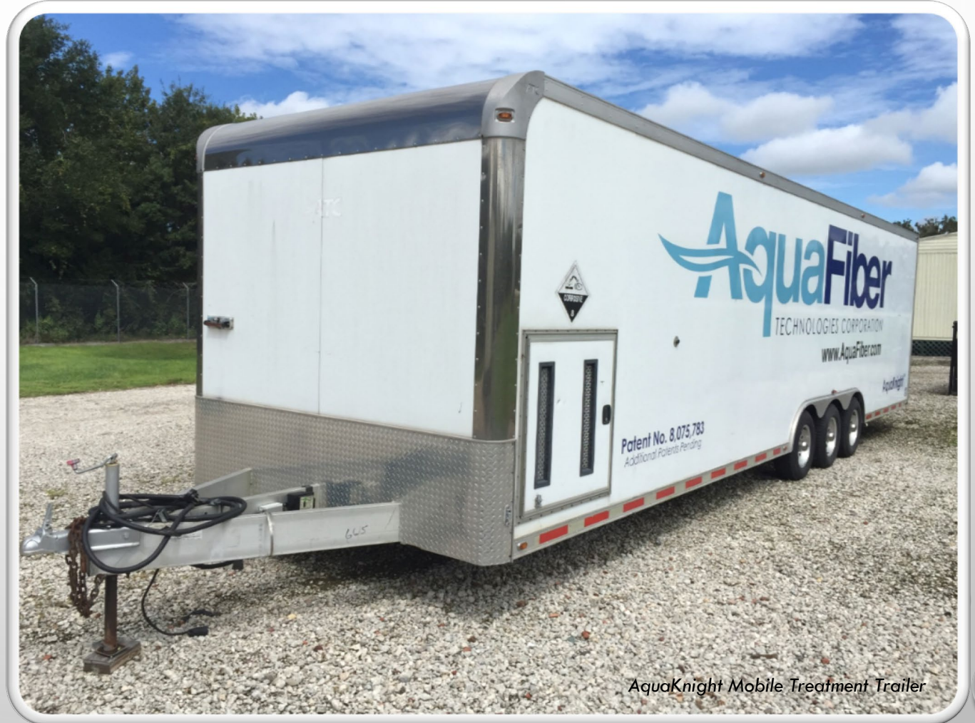
AquaKnight Mobile Treatment Trailer