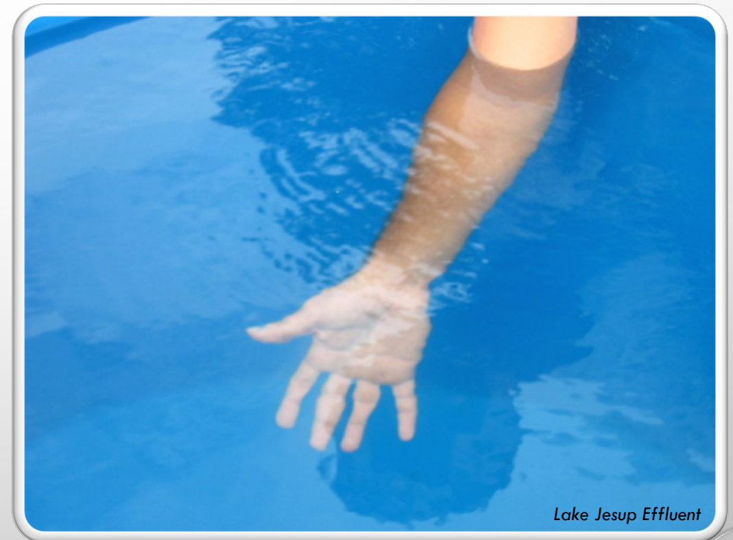
Lake Jesup Effluent